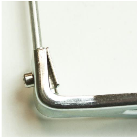
Step 6: Position the Yarn Guide (5) inside Yarn Guide Mount (3). Place the Yarn Guide Clamp (4) on top and tighten screw (8) using the Allen Wrench (7). A small gap may occur between the guide and the clamp; as long as the clamp is tight it will not affect performance