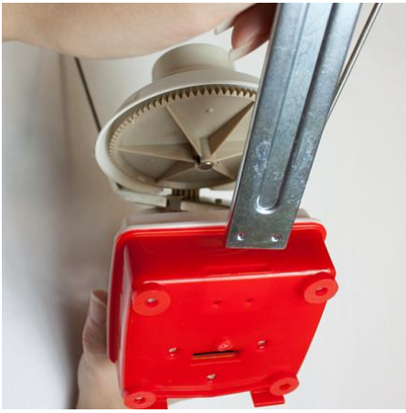
Step 4: Insert Yarn Guide Mount (3) into the slot in the front of the Winder Base (1)