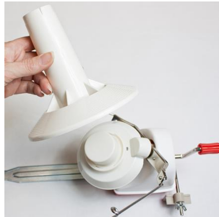
Step 7: Place the Cone (6) on to the Winder Body (1) and gently turn it clockwise to lock in place