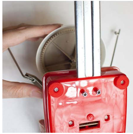
Step 5: Position Winder bottom up (1) and place 2 screws (8) into the aligned holes. Tighten screws securely using the Allen Wrench (7).